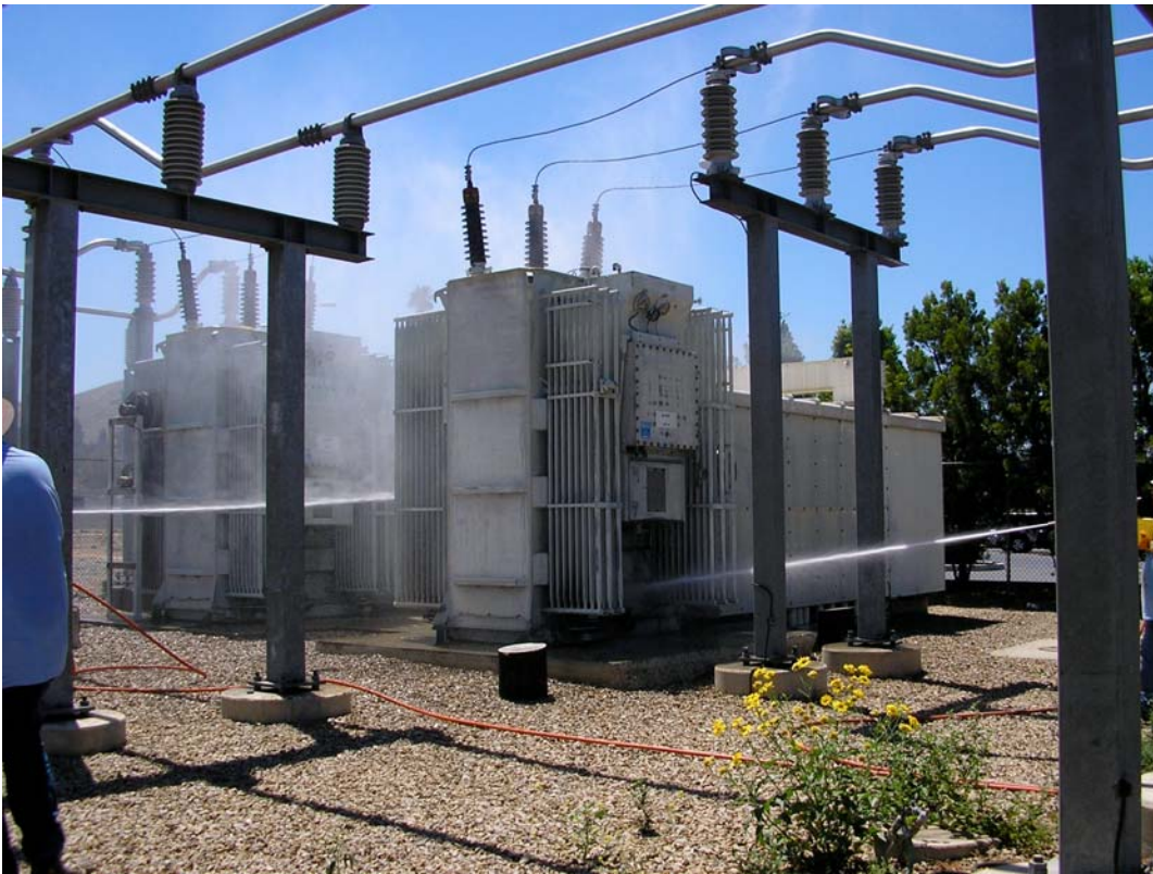
Figure 3-3. Typical Substation

A picture of a typical substation is shown in Figure 3-3. A picture of the tank containing the deionized water is shown in Figure 3-4. Two views of the spraying operation are shown in Figures 3-5 and 3-6. Note that in each case, two people perform the spraying at the same time.