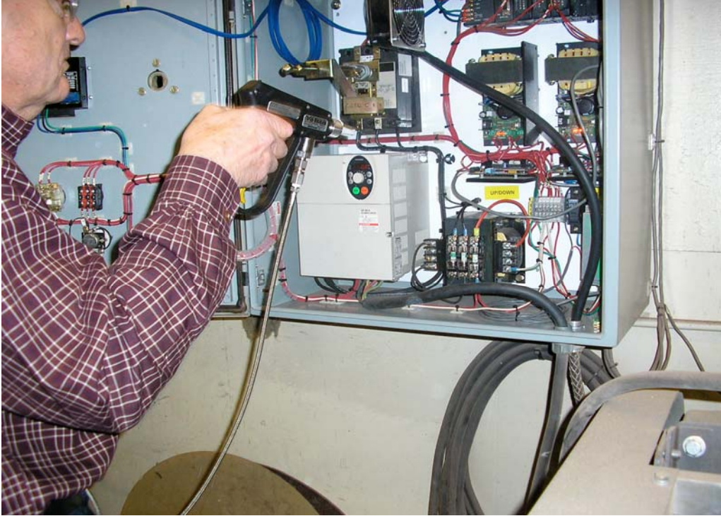
Figure 3-10. Another View of Sno-Gun Cleaning Saw Control Panel