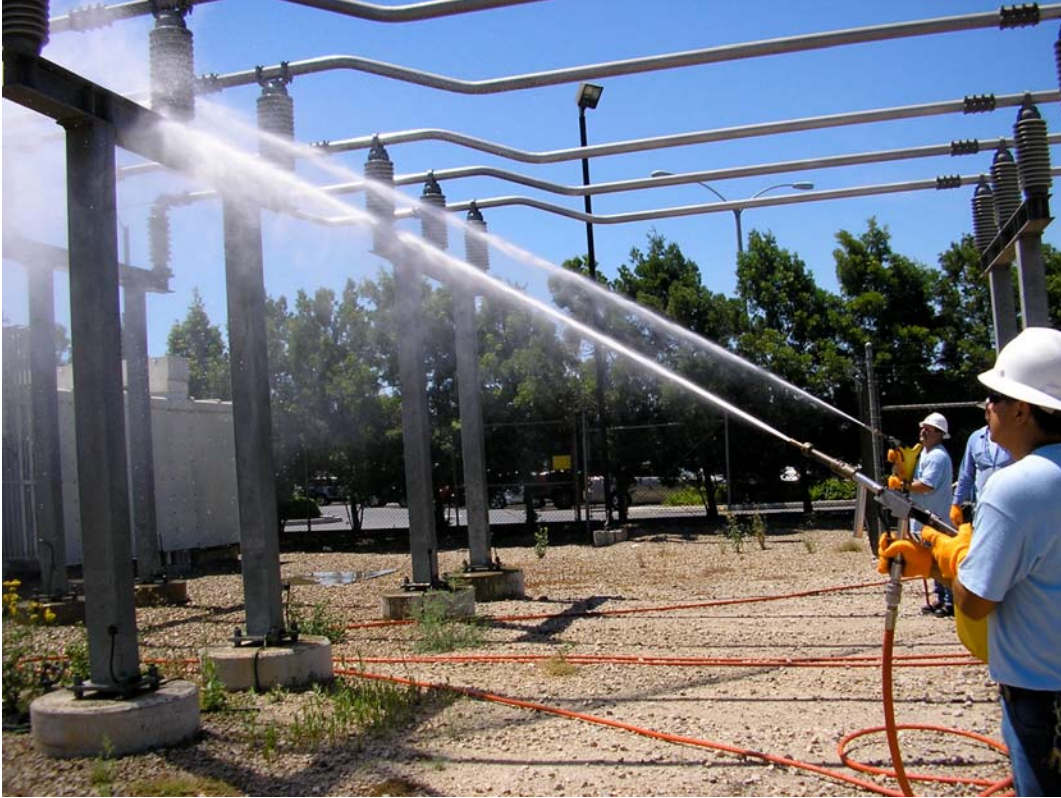
3-6. Another View of Spraying Operation

Some small utilities share a truck for cleaning with the deionized water. Other utilities do not clean at all because of the expense. If the utility is located in an area where the lines and conductors become soiled, the routine cleaning is necessary. If the soil is allowed to build up, it could conduct and cause a flash over that could require equipment replacement.