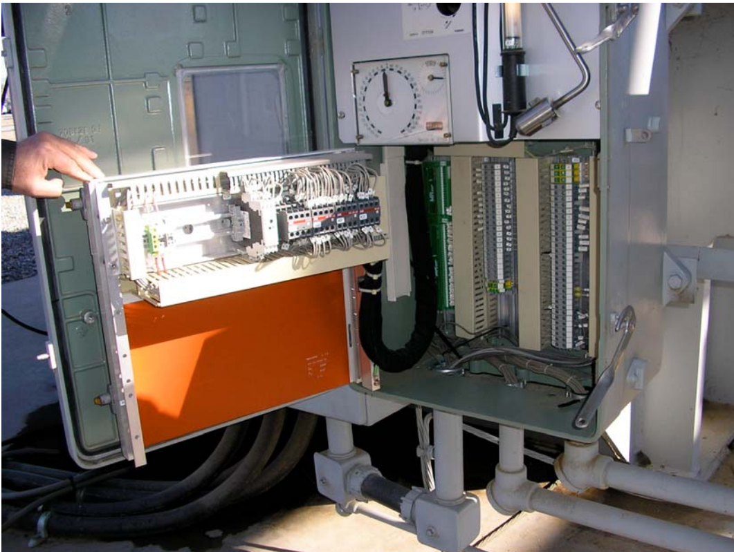
Figure 3-12. Door and Inside of Mechanism Cabinet