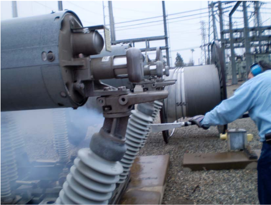
Figure 3-22. Closer View of Insulation Dry Ice Blasting