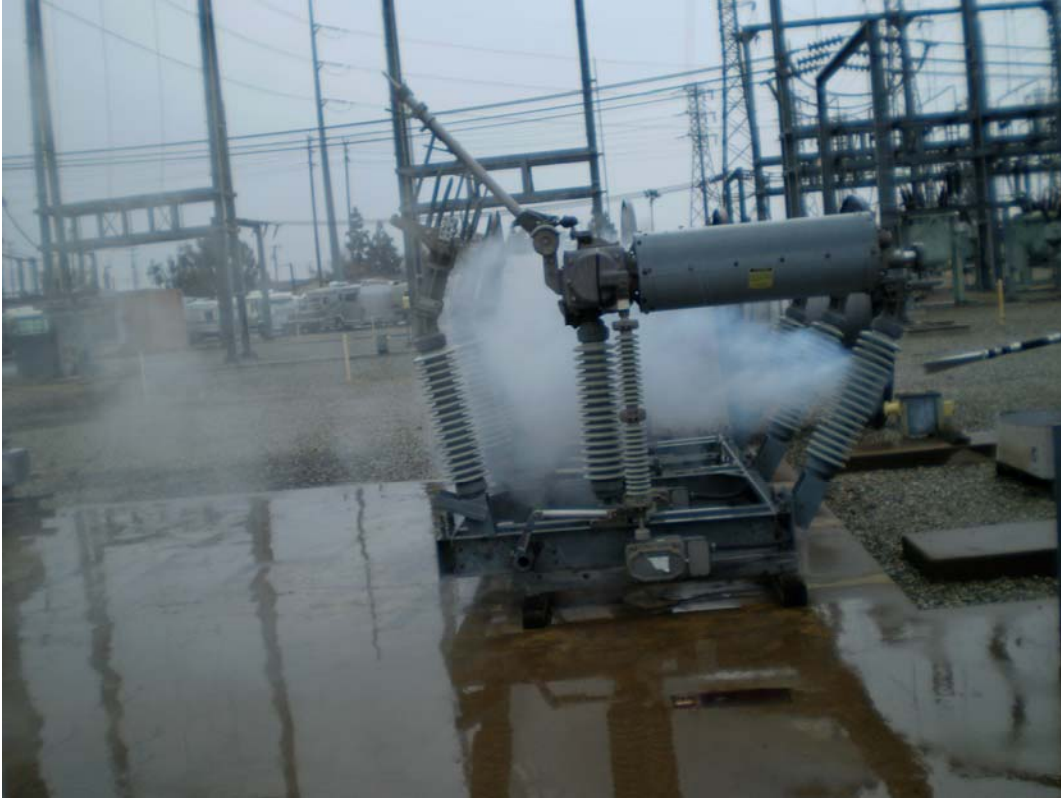
Figure 3-21. Dry Ice Blasting Wand Directed to Insulators