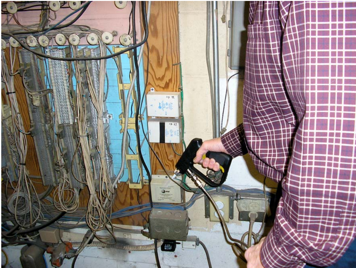
Figure 3-7. Sno-Gun Cleaning Telephone Switching Control Panel

The snow device was tested on a nine volt telephone panel which was energized during the cleaning and a smaller 460 volt machine control panel that was also energized during the cleaning. Pictures of the Sno-Gun cleaning the telephone switching control panel are shown in Figures 3-7 and 3-8. Pictures of the device cleaning the automatic head cutting saw control panel are shown in Figures 3-9 and 3-10. Both the telephone control panel and the saw control panel were heavily contaminated with dust and dirt. The Sno-Gun effectively cleaned the dust and dirt from the components, leaving a clean surface.