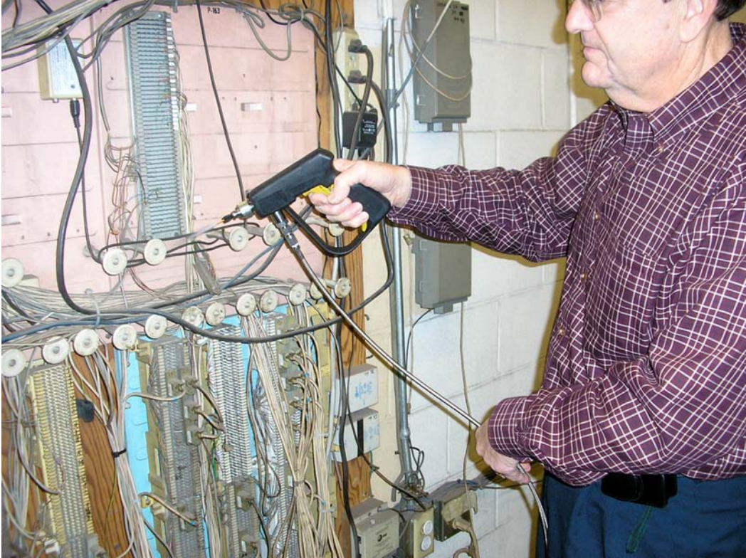
Figure 3-8. Another View of Sno-Gun Cleaning Telephone Control Panel