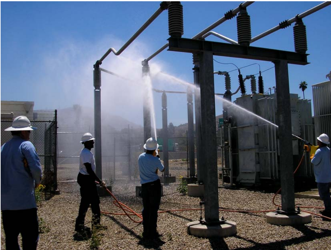
Figure 3-5. View of Spraying Operation