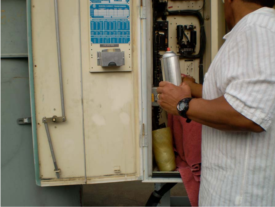
Figure 3-17. Testing Water-Based Aerosol Cleaner for Mechanism Cabinet Cleaning

One cleaner that worked well was a water-based aerosol cleaner called Kyzen Aerosol Degreaser 11 (Aerosol CAN). An MSDS for this cleaner is shown in Appendix B. Three other water-based cleaners were tested at 50 percent concentration. MSDSs for these cleaners are also shown in Appendix B. They include PWF-10, Power Kleen: Super Scrub and Mirachem Pressroom Cleaner. The personnel liked the Kyzen cleaner best, probably because it was packaged in an aerosol can, but also indicated that the three other water-based cleaners worked well. A higher concentration of the three water-based cleaners, full strength or 75 percent, may have performed even better.