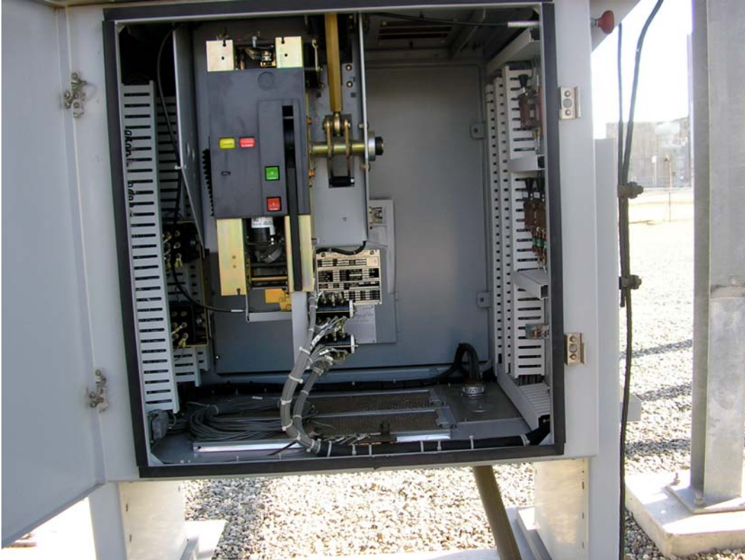
Figure 3-11. Circuit Breaker Mechanism Cabinet