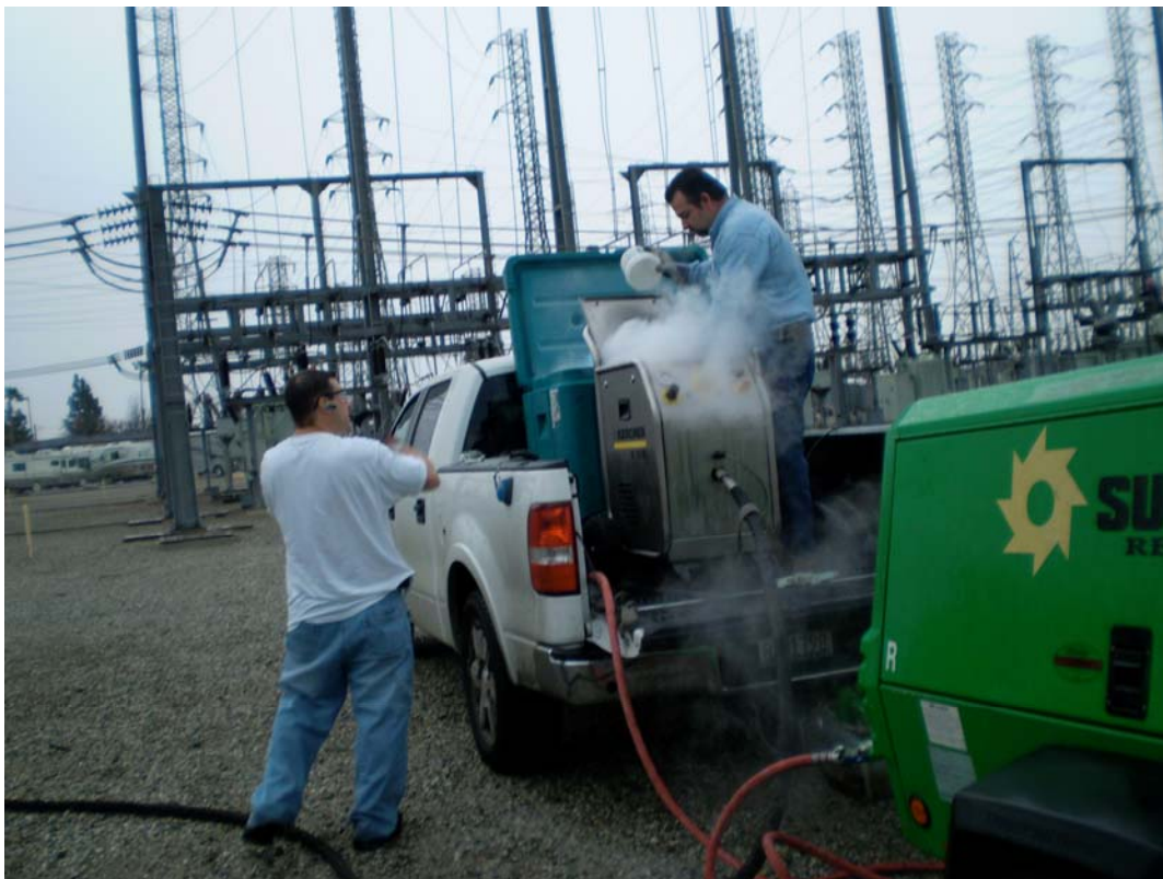
Figure 3-20. Blasting System Dry Ice Container