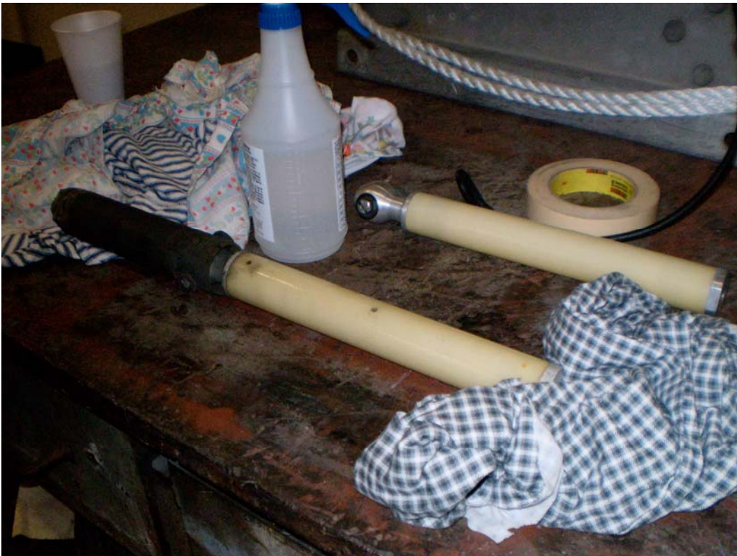
Figure 3-2. Parts Cleaned with Low-VOC Alternative Cleaners