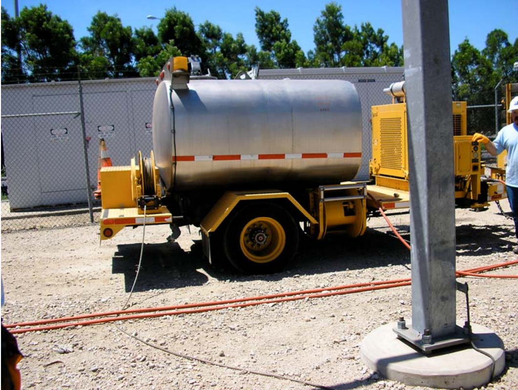
Figure 3-4. Tank Containing Deionized Water