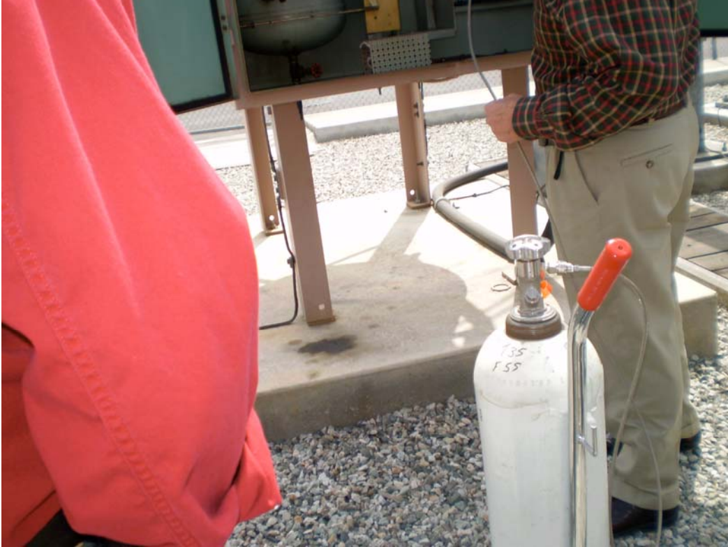
Figure 3-15. Sno-Gun Dry Ice Cylinder