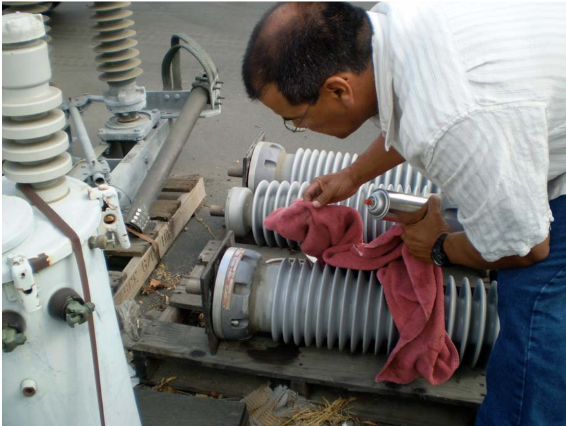
Figure 3-18. Typical Insulators

All utilities and large companies that have their own generating capability have insulators that are made of porcelain or other composite material. A picture of three insulators that are not in service are shown in Figure 3-18. Many utilities and companies de-energize the insulators that are in service and wipe them clean by hand with a wipe cloth and perhaps some deionized water. This is very labor intensive and it also requires the system to be down while the cleaning is being conducted. In some areas where there is substantial contamination, a silicon grease is used on the insulators to protect them from the environment. When these are maintained, they cannot be wiped clean and deionized water will not remove or solubilize the grease.