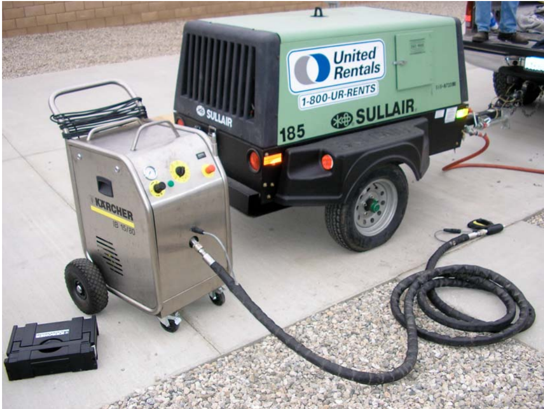
Figure 3-19. Dry Ice Blasting System Used for Testing