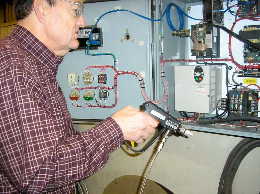
Figure 3-9. Sno-Gun Cleaning Saw Control Panel