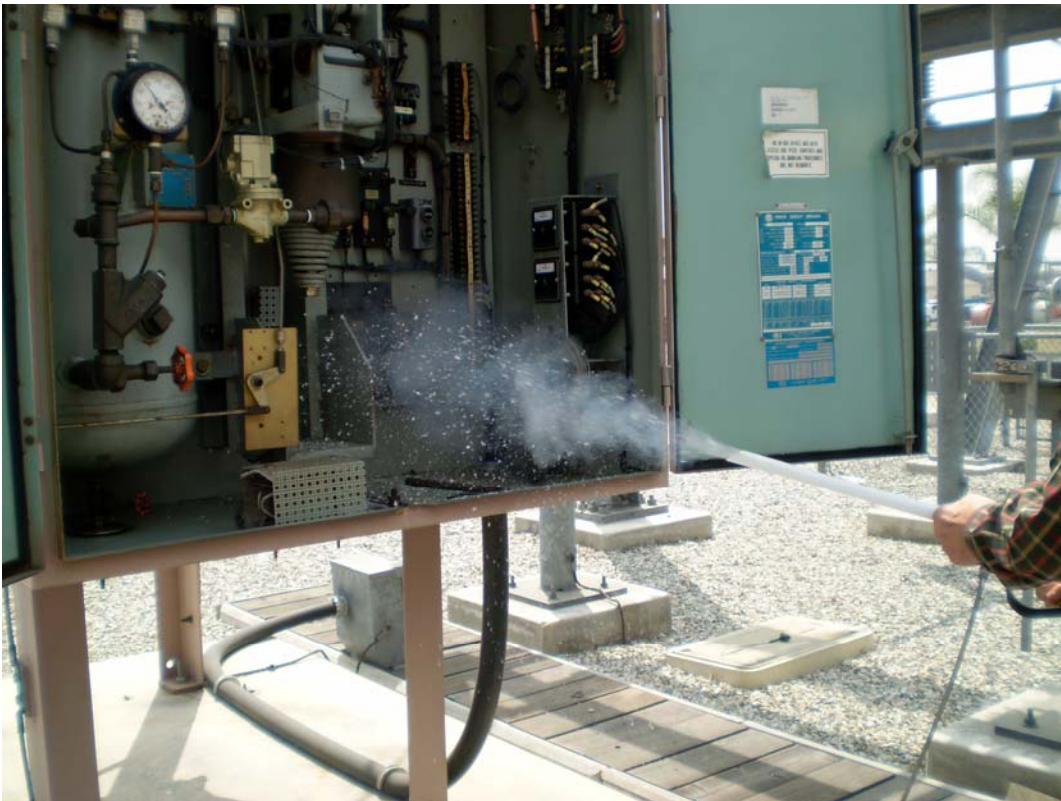
Figure 3-14. Sno-Gun Cleaning Mechanism Cabinet