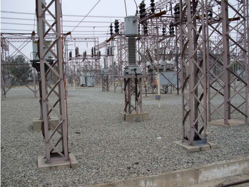
Figure 3-1. Gas Filled Circuit Breaker